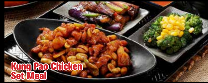
Kung Pao Chicken Set Meal