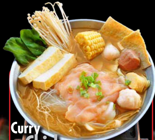
Curry Chicken Hot Pot $12.95 咖喱雞肉鍋