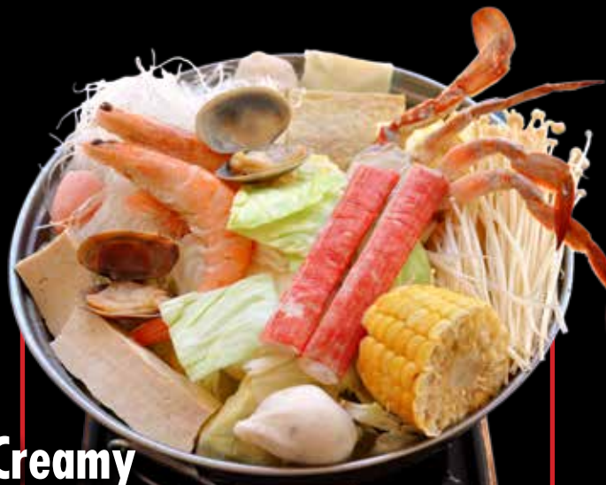
Creamy Corn Seafood Hot Pot $15.95 玉米濃湯海鮮鍋