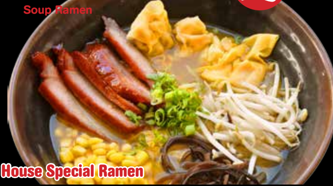
House Special Ramen