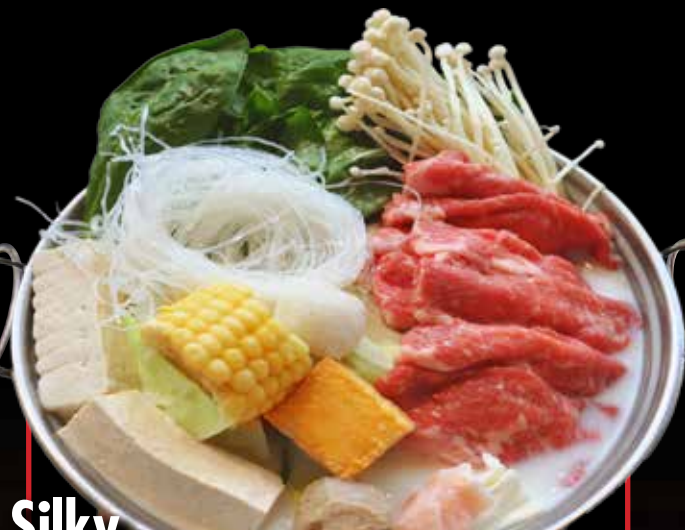
Silky Milk Beef Hot Pot $14.95 北海道牛奶牛肉鍋