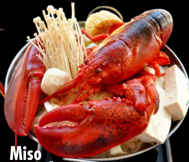
Miso Lobster Hot Pot $26.95 味噌龍蝦鍋