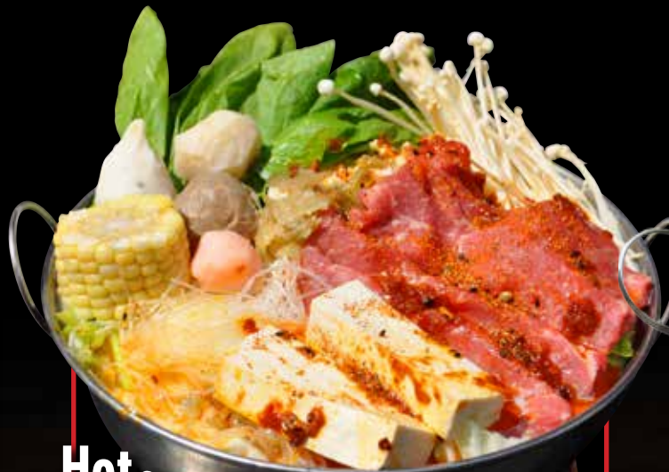
Hot & Spicy Beef Hot Pot $14.95 麻辣牛肉鍋