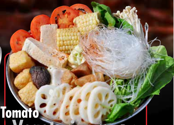
Tomato Vegetarian Hot Pot $12.95 番茄素食鍋