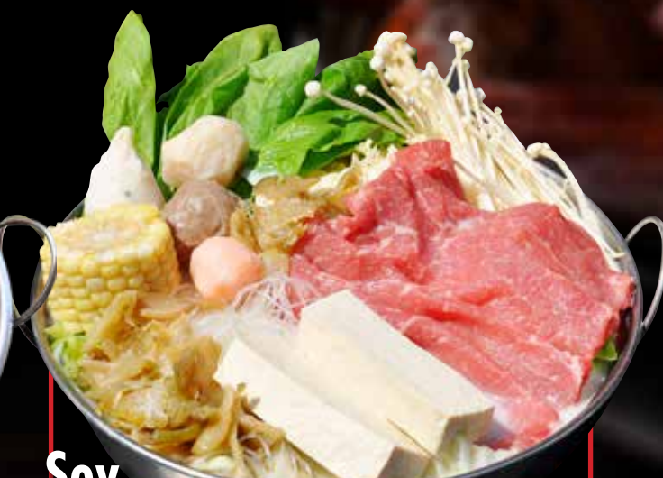
Soy Bean Milk Beef Hot Pot $14.95 咸豆漿牛肉鍋