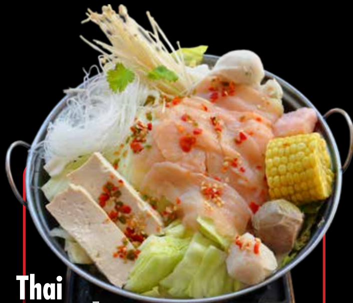
Thai Style Chicken Hot Pot $12.95 泰式雞肉鍋